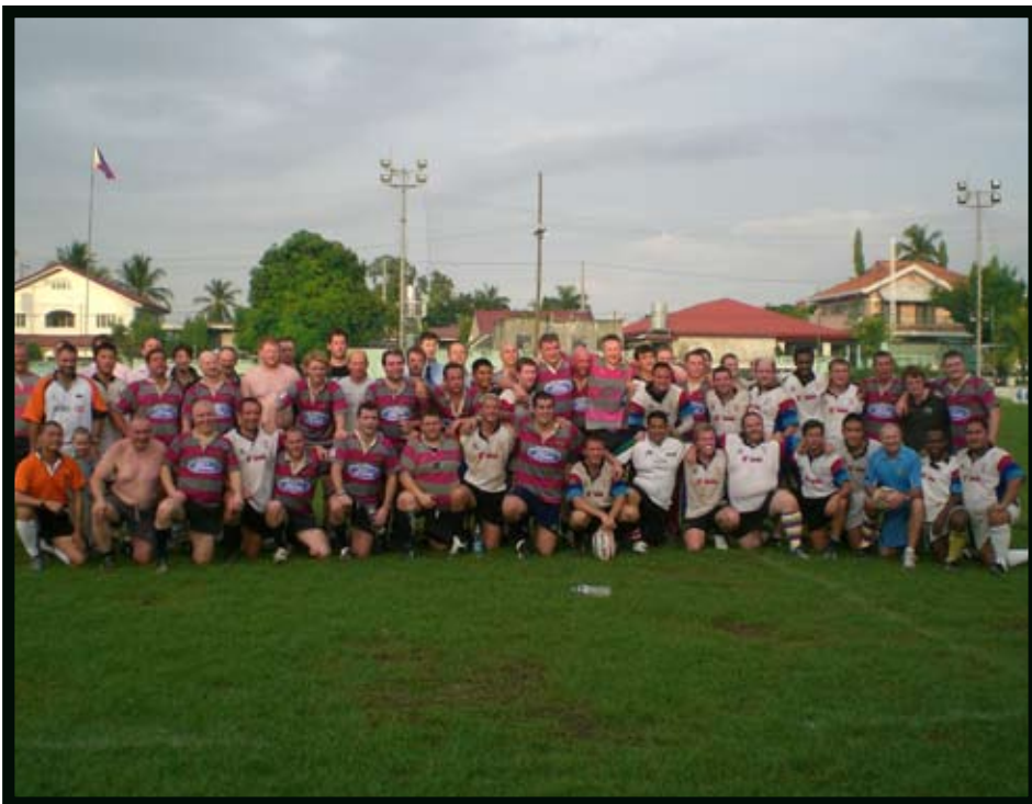
Olney RFC with the Philippine Baa Baa's

Olney had spent the week in Cebu and played the Dragons in a mid-week game. The Dragons had just come off a huge weekend after hosting the successful Cebu 10's and backed up to take on a seasoned tour squad. The Dragons shot out of the gates and scored first and this obviously fired up the Englishmen into a forward orientated game where they dominated possession to run out winners 31-7.