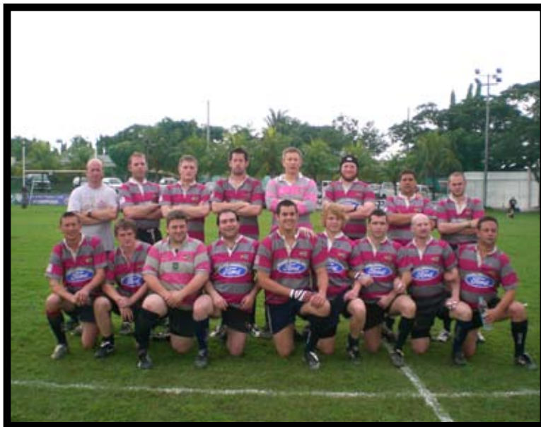
Olney RFC Team from England

After a very enjoyable match the evening carried on to the Out of Africa restaurant, where following presentations the local diners were entertained by a few rousing traditional rugby songs (clean ones, I may add).