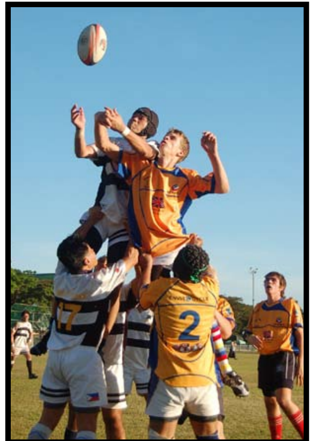
Alabang Ibons v Manila Hapons