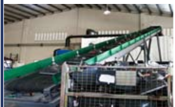
Envirocycle Inc. Sta Rosa, Laguna Plant. Left: Shredding Machine Right: CRT Crusher

For Auction Weekly Schedule Visit www.hmrauctions.com .