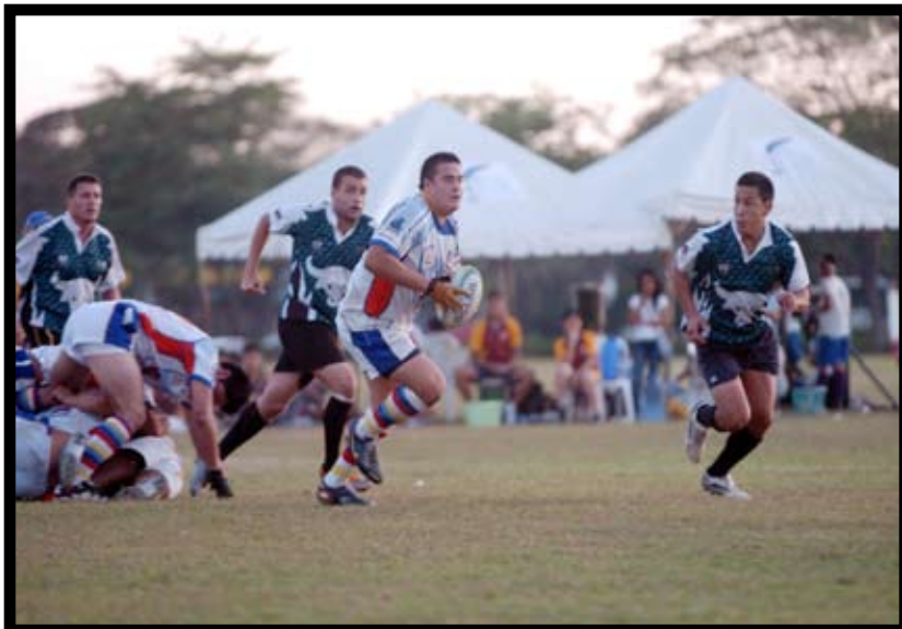
Nomads v Eagles