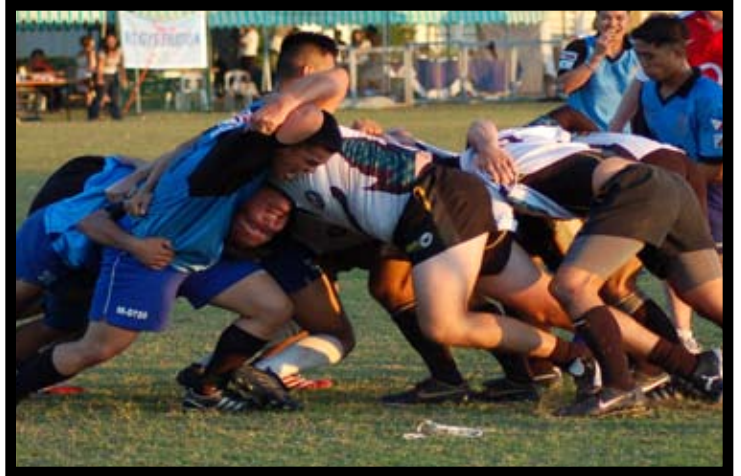
Carabaos v MAAP

Once again, Thank you to everyone involved in the 2009 PRFU 10's League.